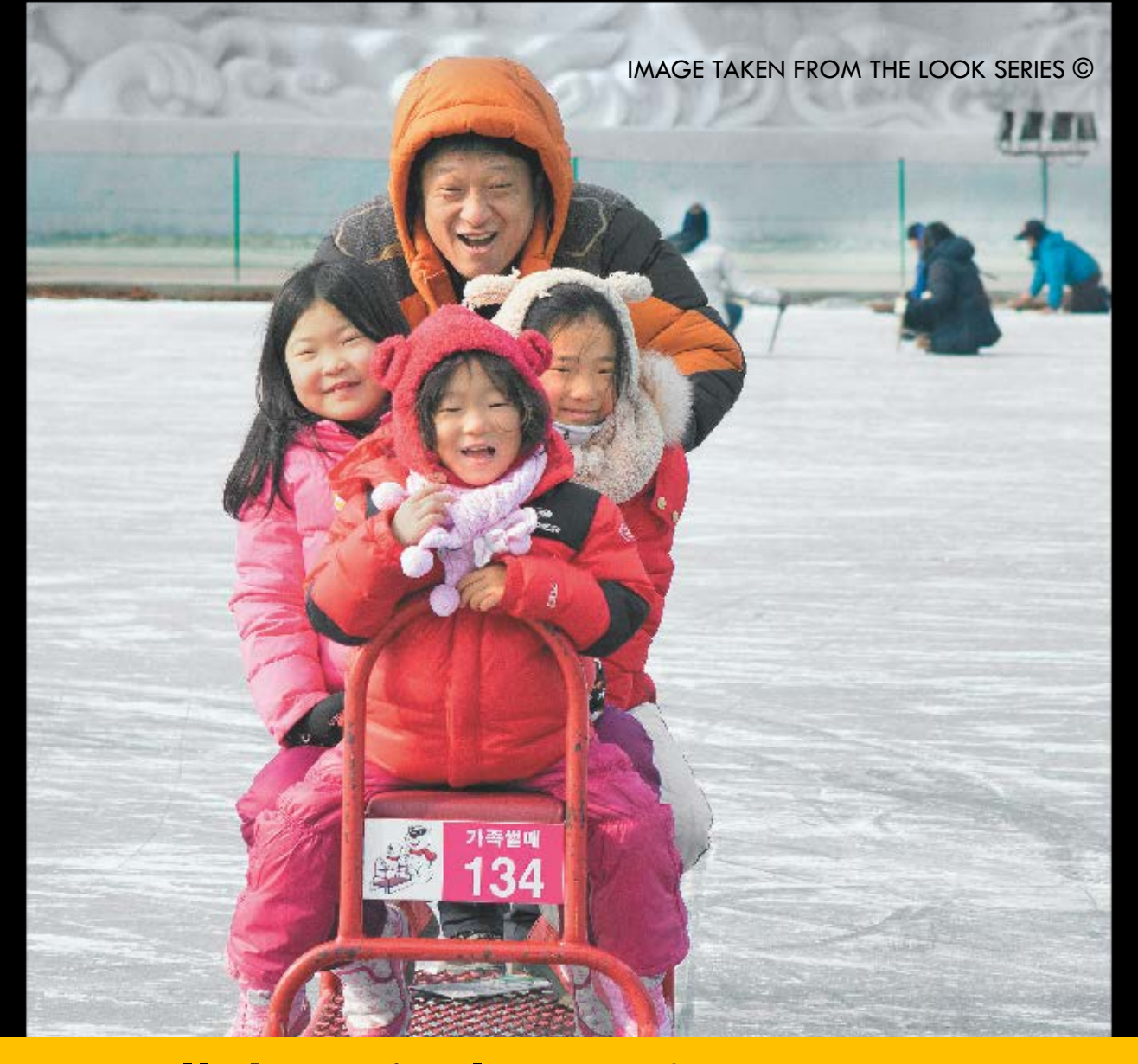
We need to work collaboratively with families rather than in parallel...